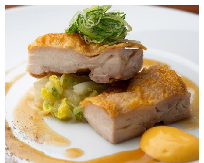
Chicken Poêle “ Sukiyaki ” Style with Kujo Leek

※We are proud to serve domestically produced rice. ※Menu item(s) and/or its production region may change based on availability ※Prices shown include tax and a 10% service charge.