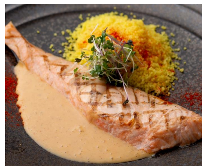
Grilled Salmon with Massaman Curry Sauce

Beef Steak with Onion and Red Wine Sauce(+¥1,210 )